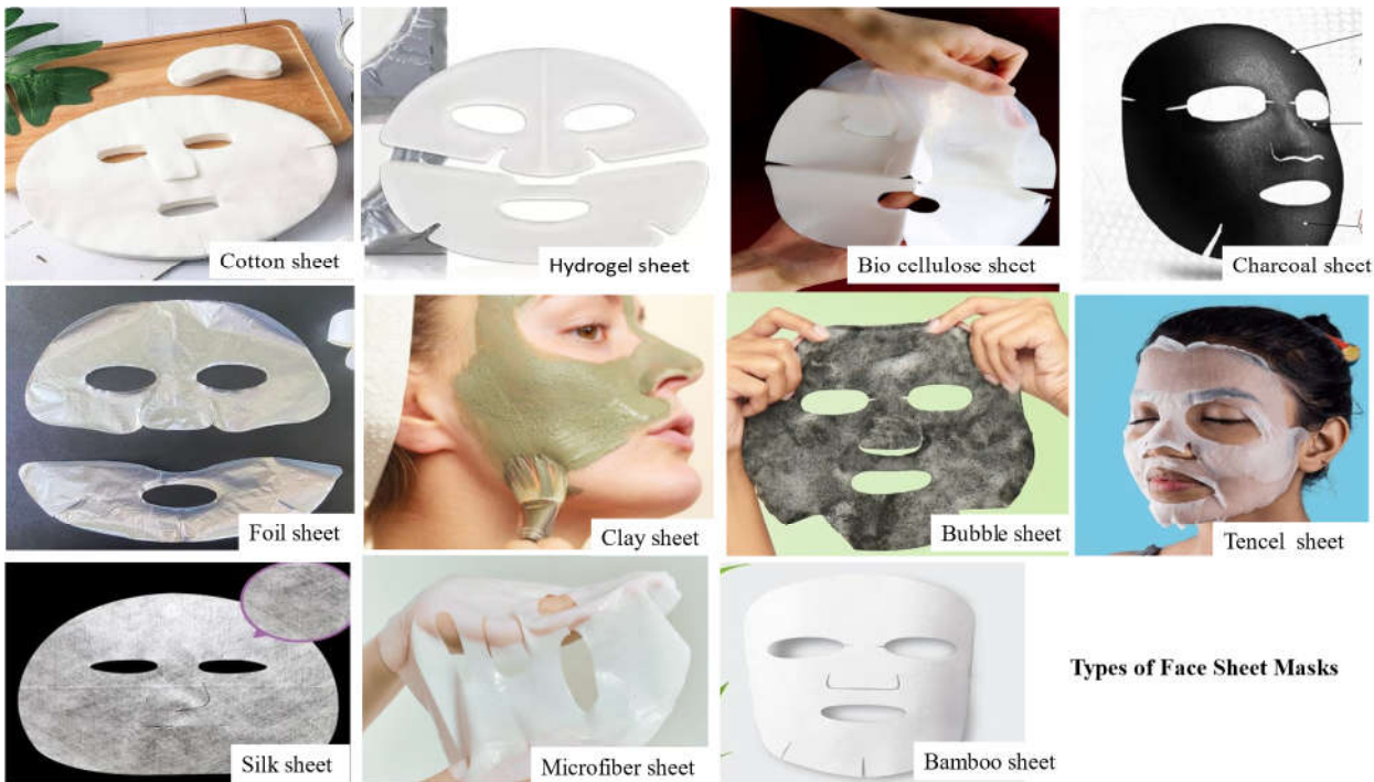
Figure 3 . Types of Face Sheet Mask

The table provides a comprehensive summary of a range of botanical, herbal, fruit, vegetable, marine, and other plant-based components frequently employed in skincare face sheet masks. It encompasses details regarding the specific plant parts used, the main benefits associated with each ingredient, commercial brands that incorporate these elements, and reference numbers for additional research. The ingredients featured in this table are recognized for their varied and advantageous properties, including antioxidant, anti-inflammatory, moisturizing, anti-aging, and skin-brightening effects, among others. These components are routinely integrated into skincare products to enhance the appearance of healthy, radiant, and youthful skin.