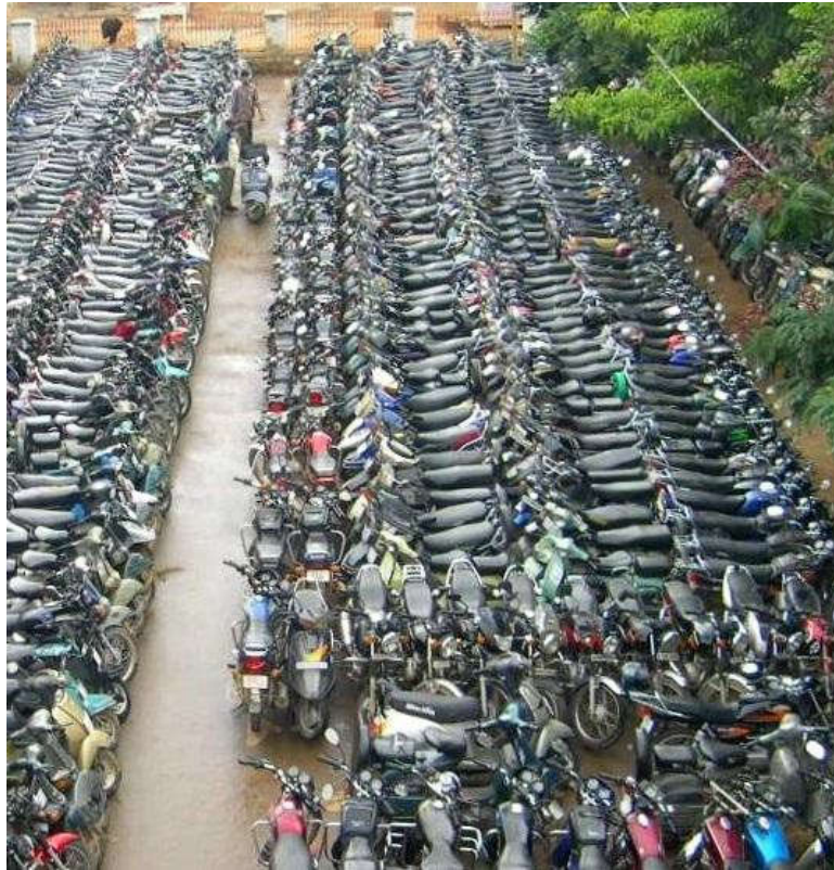
Figure 2: Rohtak Railway Station Parking site in day time