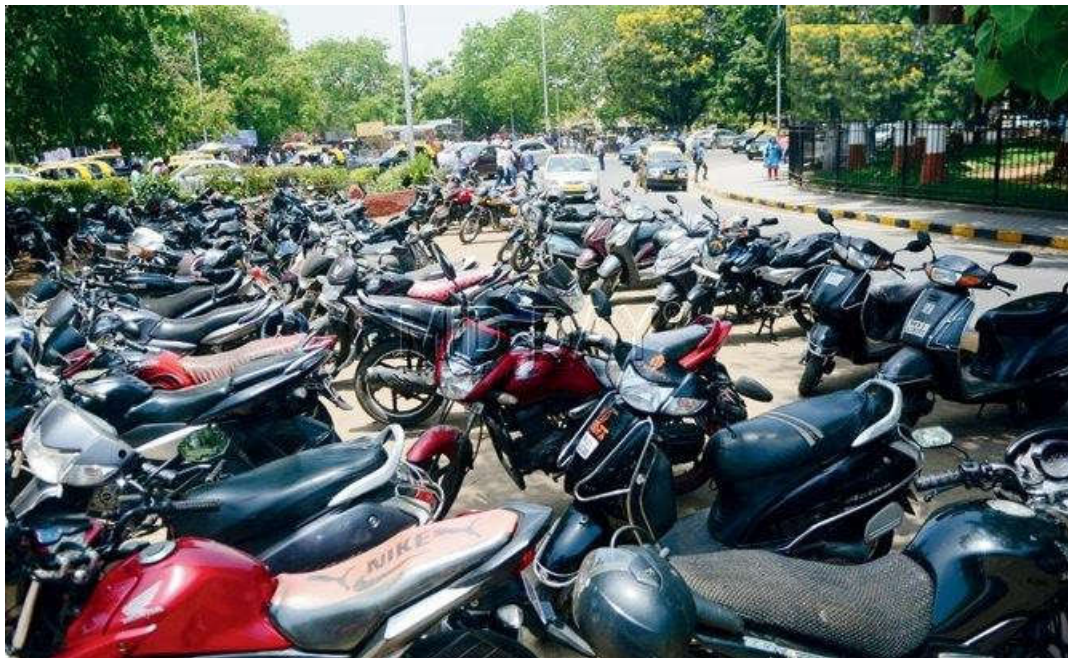
Figure 5: MDU Rohtak Parking site