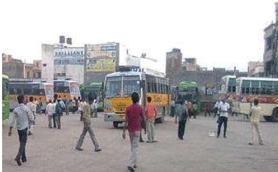
Figure 4: Rohtak Old Bus Stand Parking site for buses