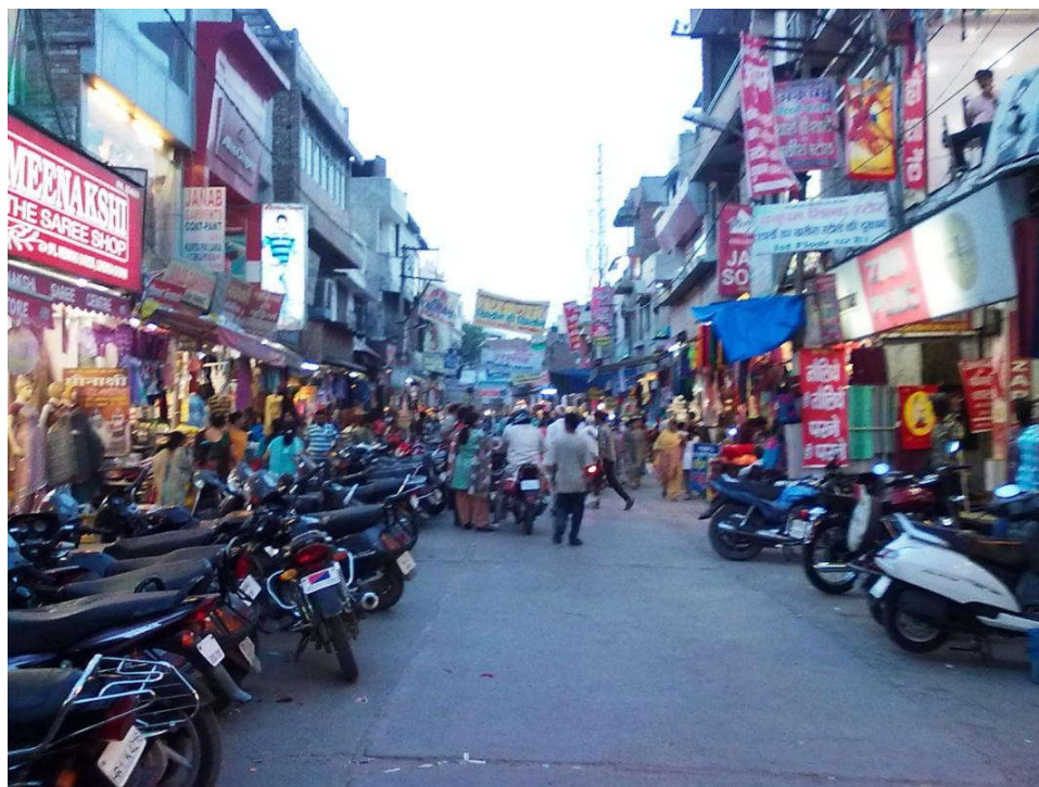
Figure 7: Quilla Road Market Rohtak Parking view