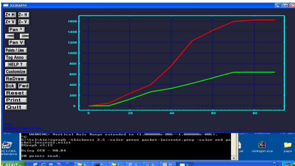
Figure 3: Packet Loss Analysis

Figure 2 depict that the packet communication is been increased continuously in proposed approach. As the nodes are dead no more communication is performed over the network. Here straight line represents the dead network situation. In this figure, x axis represents the simulation time and y axis shows the packet communication. Here the figure is showing the packet communication specifically for proposed work. The figure shows that initially the packet communication in case of proposed work is higher.