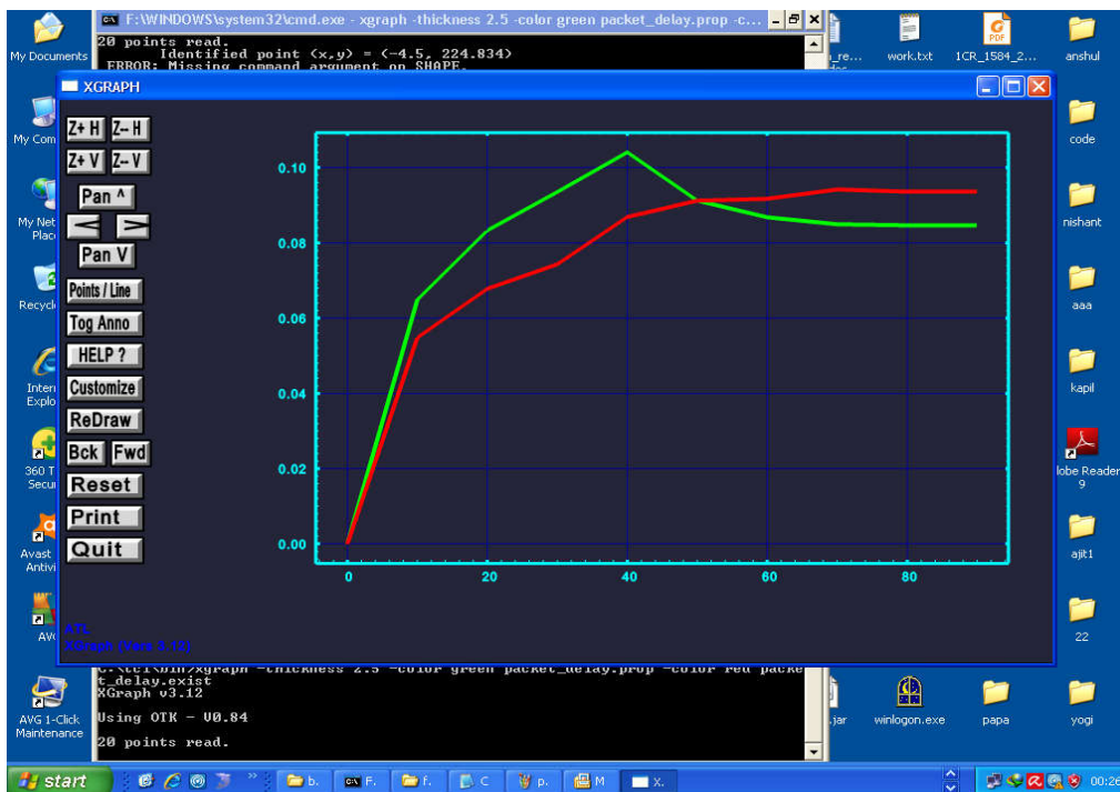
Figure 4: Packet Delay Analysis

Here figure 3 is showing the packet loss analysis over the network in case of existing and proposed work. Figure shows that the packet loss in case of proposed work is much lesser than existing work. In this figure, x axis represents the simulation time and y axis shows the packet communication loss.