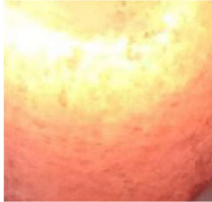
Figure 1: Melting of Aluminium Alloy 6082

Melting point of Aluminium Alloy 6082 is 550°C. In present work, first of the graphite crucible heated to 600°C for 10minutes. and work pieces of AA 6082 putted in the heated graphite crucible. Further it heated to 700°C for completely melt the AA 6082. It takes near about 20minutes.