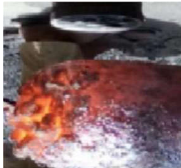
Figure 2: Pouring of Liquid MMC

The stirred liquid metal matrix composite further poured into to sand moulds of 20mm diameter and 1 foot of length as shown in figure 5.2.