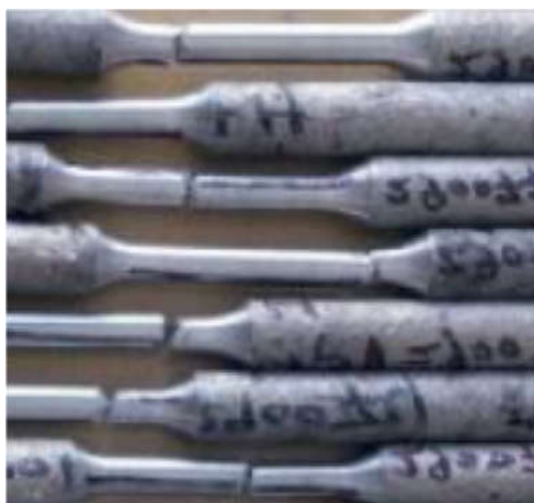
Figure 5: Samples after Ultimate Tensile Strength Test

Ultimate tensile strength (UTS) often shortened to tensile strength (TS) or ultimate strength, is the maximum stress that a material can withstand while being stretched or pulled before failing or breaking. The UTS is usually found by performing a tensile test and recording the engineering stress versus strain curve. The highest point on the stress-strain curve is the UTS. In present work, IS 1608-2005 Universal Testing Method is used to find out UTS in MPa.