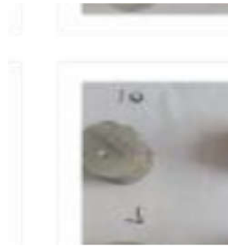
Figure 4: Samples after Hardness Test

Hardness is a measure of how resistant solid matter is to various kinds of permanent shape change when a compressive force is applied. Some material such as metal, are harder than others. In present work, IS 1500(Part-1)-2013 Brinell hardness test method is used to find out the hardness of fabricated composites. In this method aluminium alloy composites are tested using 250Kg test force and a 5mm carbide ball.