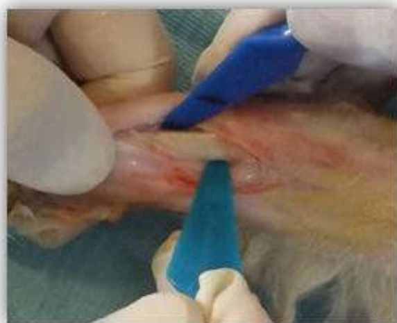
Figure (2) Rabbit's Tibia Bone

Three small holes (Figure 3) approximately 10 mm apart (with a 1 mm rounded head drill) were done using implant surgical engine (Surgic XT – NSK/ U.K), the rotational speed was 1100rpm, "FWD-<" clockwise rotation", and a torque of 35newton/cm.