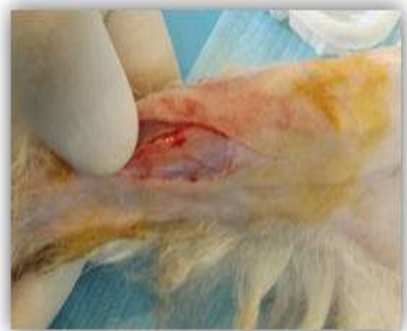
Figure (1)An incision parallel to longitudinal axis of the tibia

A thirty sterile Orthodontic micro-implants(Dentos, AbsoAnchor, SH1312-5/ tapered type, South Korea), made of Ti-6Al-4V alloy, with a diameter of 1.3mm and 5mm length were used. At the time of the surgery, each experimental animal was premeditated using intramuscular injection of 0.2 ml/kg B.W. of Ketamine 10% (anesthetic solution) and 0.025ml/kg B.W. of Xylazine 2% (muscle relaxant drug), the medial surface of the right tibia anaesthetized by 1ml of local anesthetic solution 2% Xylocaine, after shaving the site, the exposed skin disinfected using 10% Povidone Iodine. An incision of approximately 35 mm in length (Figure 1), in the dorsal aspect of the tibia, down in the skin parallel to the longitudinal axis of the tibia, dissecting the fascia and the periosteum was stripped and elevated denuding the medial aspect of the tibia bone (Figure 2).