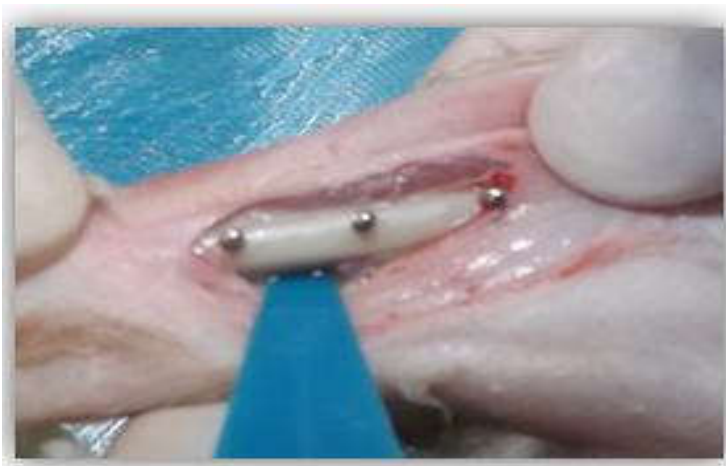
Figure (4) Three Orthodontic Micro-Implants in Place

The micro-implants were inserted by special handdriver, the longaxis of the micro-implant was kept perpendicular to the external cortical tibia as possible (Figure 4).