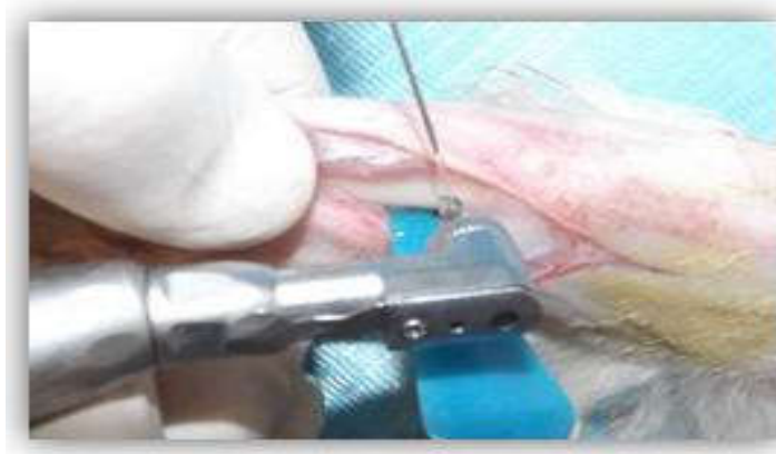
Figure (3) A small hole preparation

The micro-implants were inserted by special handdriver, the longaxis of the micro-implant was kept perpendicular to the external cortical tibia as possible (Figure 4).