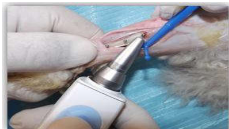
Figure (5) Primary Stability Reading

The primary stability then tested using Periotest Mdevice (Medizintechnik Gulden – Germany), the Periotest M device held horizontally with the starting bottom up, the tip of the hand piece was kept at a distance about 2-3 mm from the micro-implant head, and perpendicular to the micro-implant head as possible. Three readings for each micro-implant were taken, and the mean for such three readings were taken as a final reading (Figure 5).