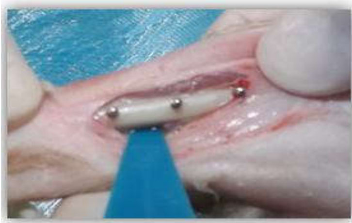
Figure (4) Three Orthodontic Micro-Implants in Place

The micro-implants were inserted by special handdriver, the longaxis of the micro-implant was kept perpendicular to the external cortical tibia as possible (Figure 4).